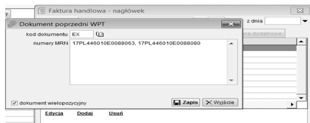
Fig. 3. Third step of registration: entering two previous documents, such as export declarations

The third step is also performed in the "commercial invoices" tab. In the "information documents" window, the previous two export declarations with two different MRN numbers were entered as a document.