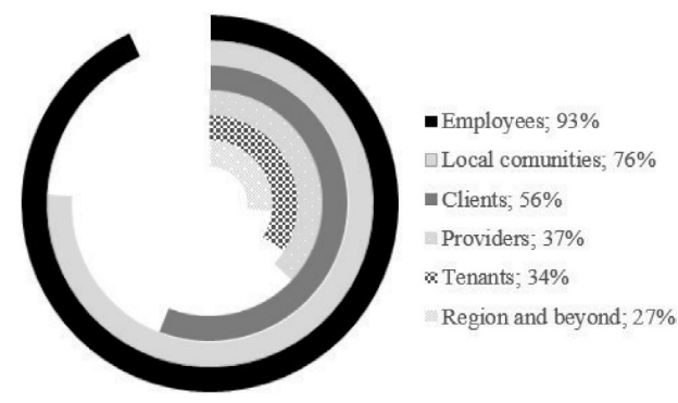
Fig. 2. Percent of stakeholders involved in corporate social responsibility initiatives in European seaports Source: Trends In EU Ports Governance 2016, ESPO, Brussels 2016.

Not all of stakeholders are involved in sustainable initiatives to the same degree. It is good to remember that actors taking part in port operations have their own interests and objectives, sometimes not coherent with each other. Besides, it is possible that some community stakeholders may be unaware of their relationship to the port until a specific event - favourable or unfavourable - draws their attention<sup>13</sup>. The research done by ESPO shows that stakeholders that were the most interested in CSR initiatives belonged to a group of internal stakeholders – employees (fig. 2).